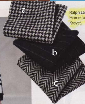
Ralph Lauren Home fabric, Kravet.