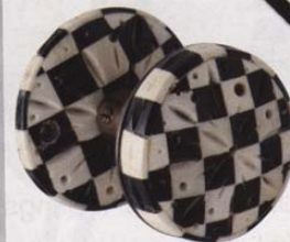
Scrimshaw doorknob, Anthropologie.