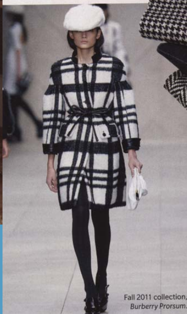
Fall 2011 collection, Burberry Prorsum.